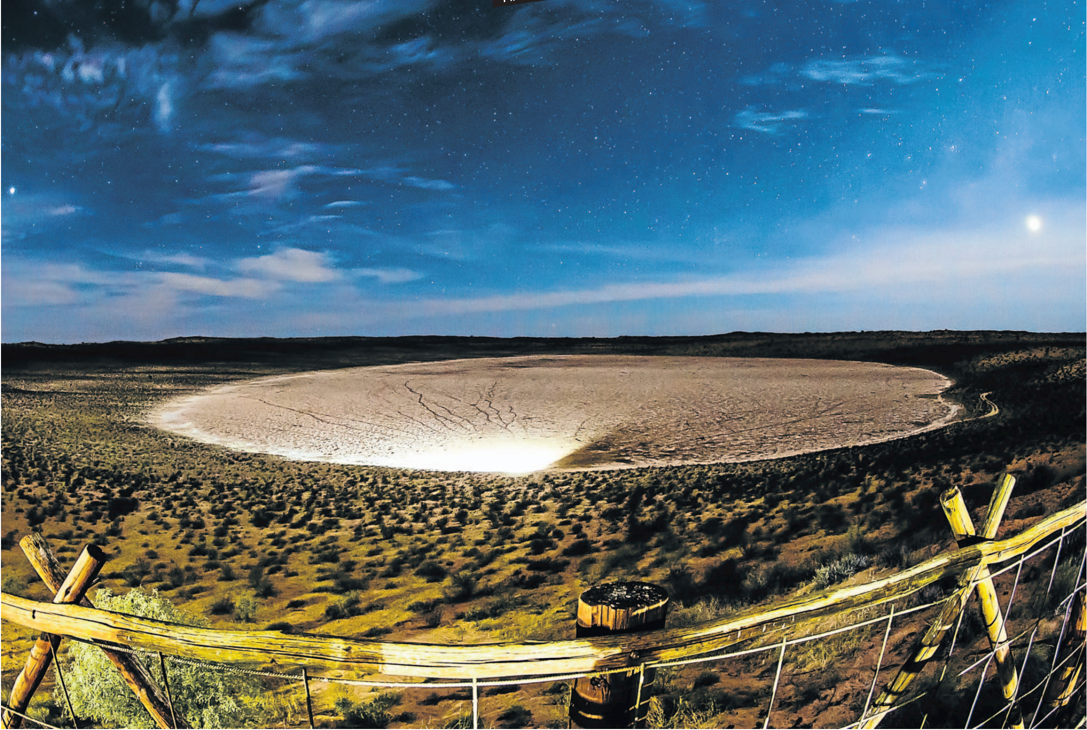
LIGHT UP YOUR LIFE Flood lights on the pan in the Kgalagadi Transfrontier Park.