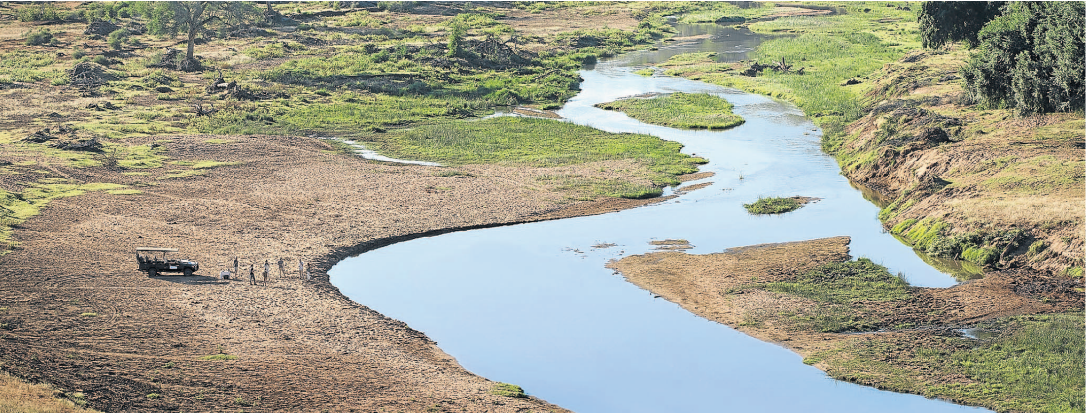
LUXE AFRICA Take your coffee with panoramic views in the Kruger National Park with Pafuri Camp.

There are splendid experiences to be found on the edges of South Africa, writes Hlengiwe Magagula